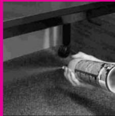
Use surface spray inside your home