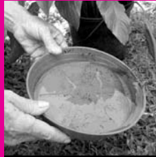
Empty containers that hold water