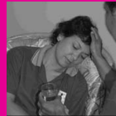
See a doctor if you have any symptoms