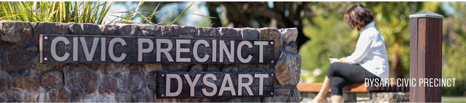
DYSART CIVIC PRECINCT