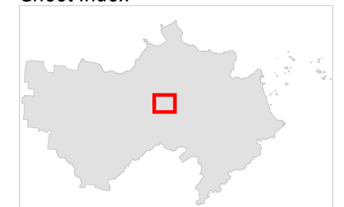
Potential Hazardous Dust - OM 10 Moranbah