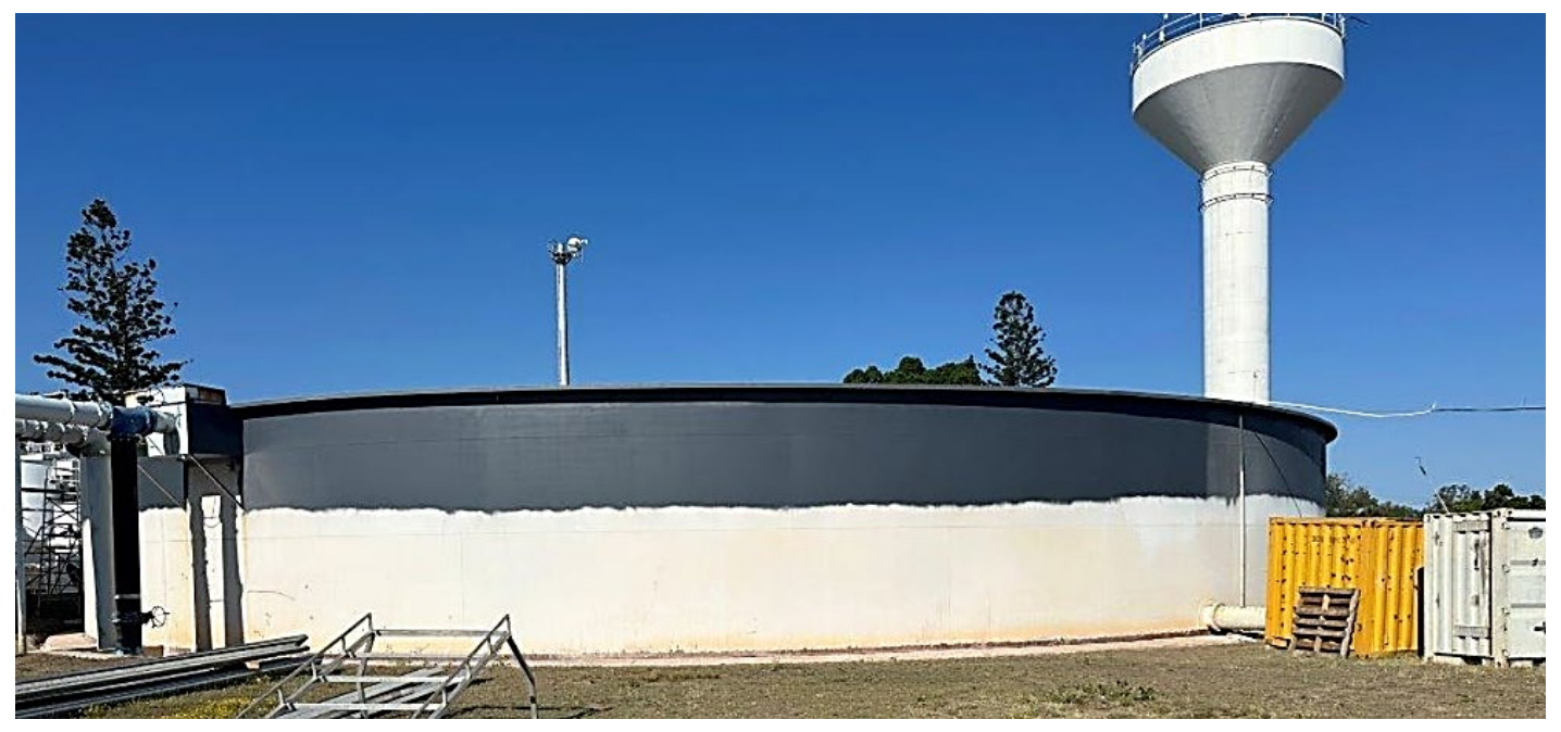
Image 1: Moranbah Water Treatment Plant Roof Replacement – External Wall Primer Application