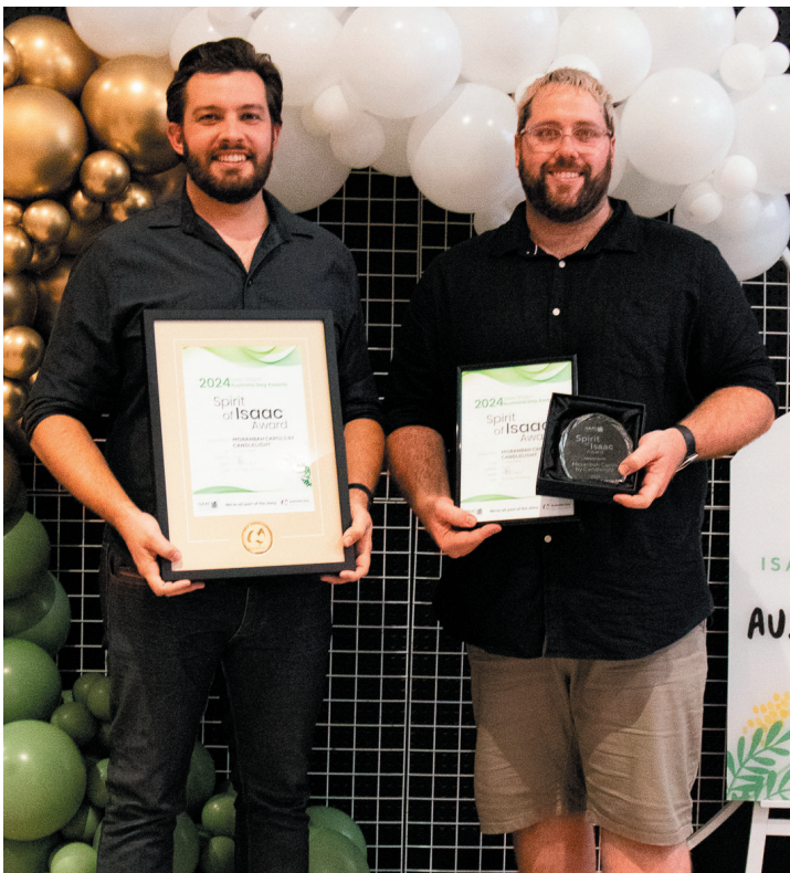
Spirit of Isaac Award winner Moranbah Carols by Candlelight, Moranbah