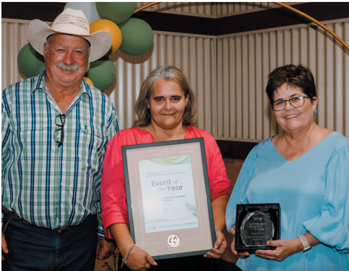
Event of the Year winner Clermont Wombat Festival, Clermont