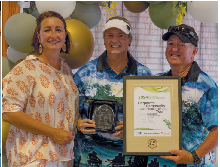
Corporate Community Contribution of the Year winner BarraCrab Caravan Park, Clairview