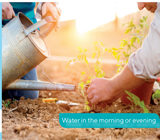
Water in the morning or evening

Find out more isaac.qld.gov.au/save-water