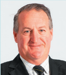
CR SIMON WEST

Visit isaac.qld.gov.au/shop-isaac for more information or call 1300 ISAACS (1300 47 22 27).