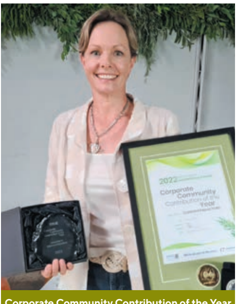
Corporate Community Contribution of the Year Clermont4Doctors. Clermont