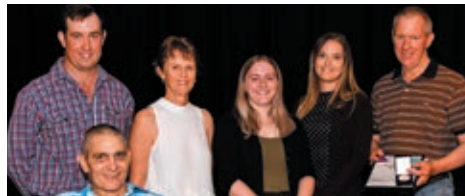
Hoch & Wilkinson - Clermont