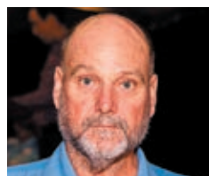
RSL Sub Branch Clermont