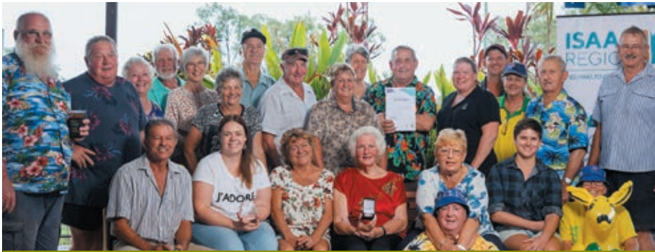
Community Event of the Year - St Lawrence Wetlands Weekend

The event recently won the best festival and events award at the 2019 Mackay Region Tourism Awards. This was the third time they have been honoured at the awards.