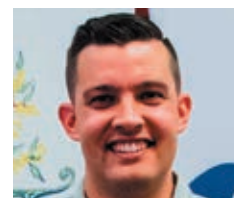
Oasis Life Church Moranbah