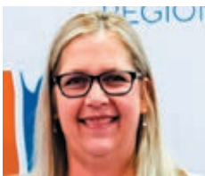
Bright Kids After School Care - Moranbah