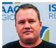
Moranbah Bulldogs AFL Club - Moranbah