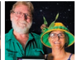
John Crooks Home Timber & Hardware - Dysart