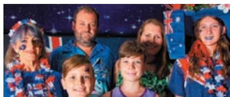
Dysart Arts Drama Club Dysart