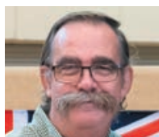
Middlemount Golf and Country Club