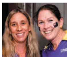
Clermont Netball Association - Clermont