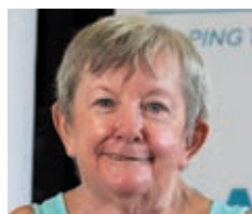
Nebo Community Sport and Recreation Club