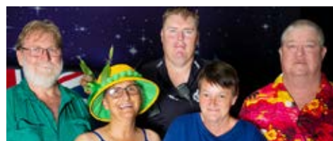
Dysart Santa Run Dysart