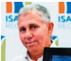
Hornery Trading Group Moranbah