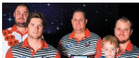
Dysart Senior Rugby League Dysart