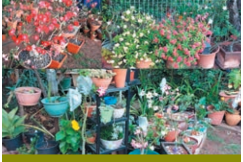
Best potted garden