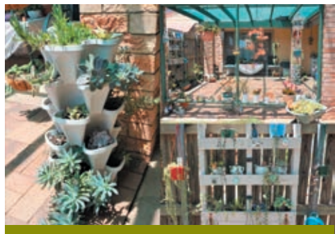
Best edible garden Best drought resistant garden