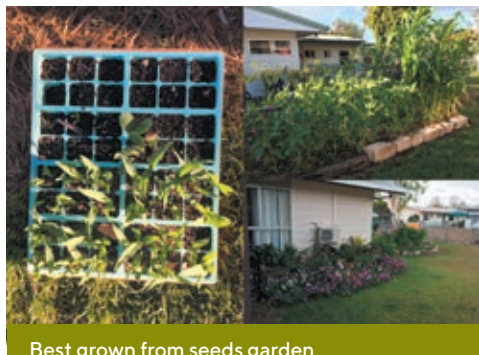
Best grown from seeds garden

For more information on Shop Isaac visit www.isaac.qld.gov.au/shop-isaac or call 1300 ISAACS.