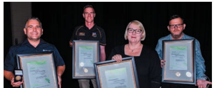
Corporate Community Contribution of the Year Isaac Community Chest Contributors