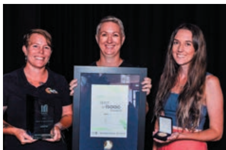
Spirit of Isaac 4RFM