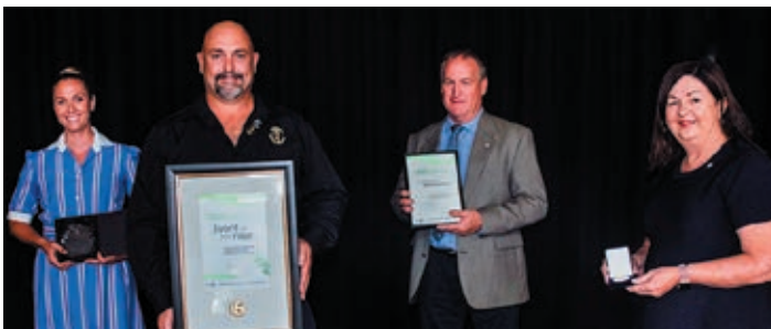
Event of the Year Moranbah Miners' Memorial and Driveways at Dusk

Visit Council’s Facebook page for images of your local event.